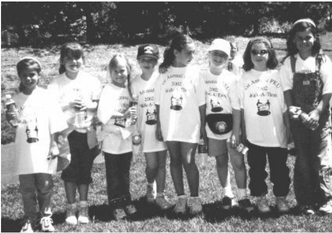
New and old friends at the "PKU Walk"

Enclosing a "Request to receive funds from the MACPAD Research Fund" with this newsletter. The board is willing to review any research currently being done. If you know of anyone doing research into metabolic disorders, please forward this form to them and notify MACPAD of their name and address. The board welcomes any and all suggestions.